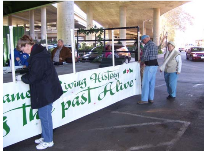
Just getting started—affixing the banner to the float.