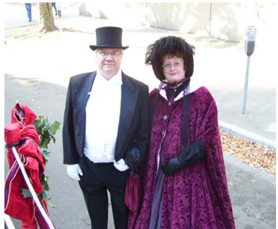
The well-dressed Melaus