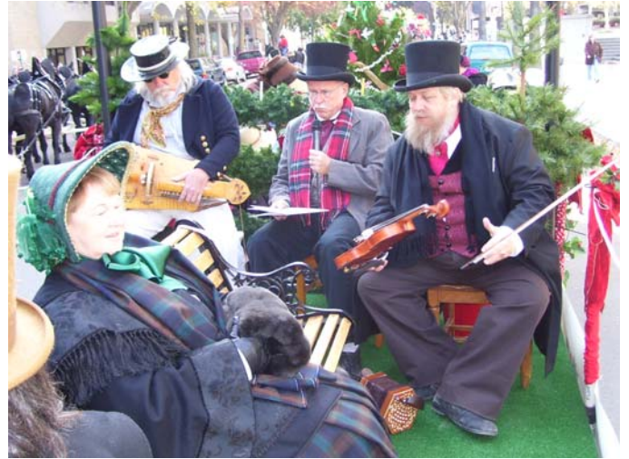
Our talented and handsome musicians.

All in all, I heard that audience members shouted out that this was our "best float ever." I sure thought it was! Thank all you for all of your energy, time, and creativity. I could not have done it without all of you.