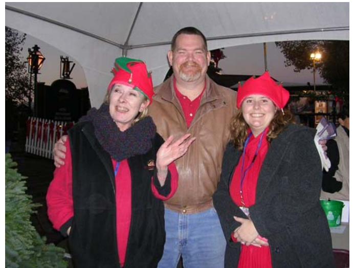
HOSF elves at the Christmas tree lighting.

Remember the date for December LHD has been moved up to the 23 rd . For those hardcore members who are interested the 30 th could still be an option for Auld Lang Syne. We will discuss this issue at the general meeting on December 12 th .