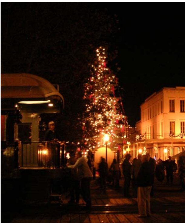
The newly lit Old Sacramento Christmas tree

The tour traveled through time and stopped along the many rooms of the fort. The spirits of the time discussed the issues of the Mexican-American War, Colonel Fremont, the native chieftain Yellow Serpent, and a missing dog, Fluffy! The stories at each venue carried a thread of history of the time period, as well as providing some humorous and comic relief, too. The costumed docents were well-rehearsed and soon we happened upon OSLHP's Biscuits! He does show up everywhere, doesn't he?! The tour ended in the great room of the large building in the center of the fort. We each received a warm libation in a souvenir drinking cup along with a delicious piece of pie. The time passed quickly and before you knew it, we were back in modern-day Sacramento.