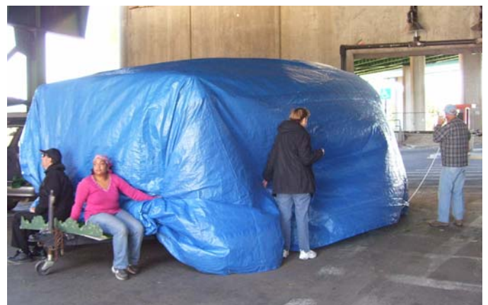
Wrapping it up. (Really, there is a float under there!)