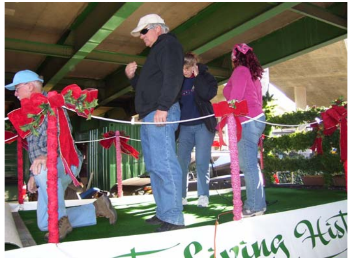
Installing the park "grass."