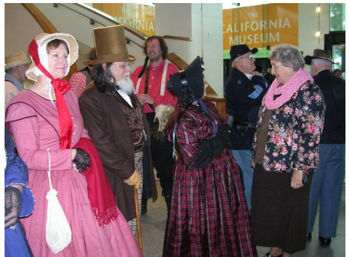
Chatting before the ceremonies.