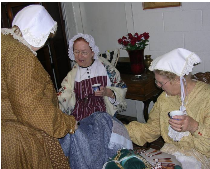
A few of the proper ladies on Free Museum Day.

This is a new twist to Women's History Day, and it should be a wonderful event!