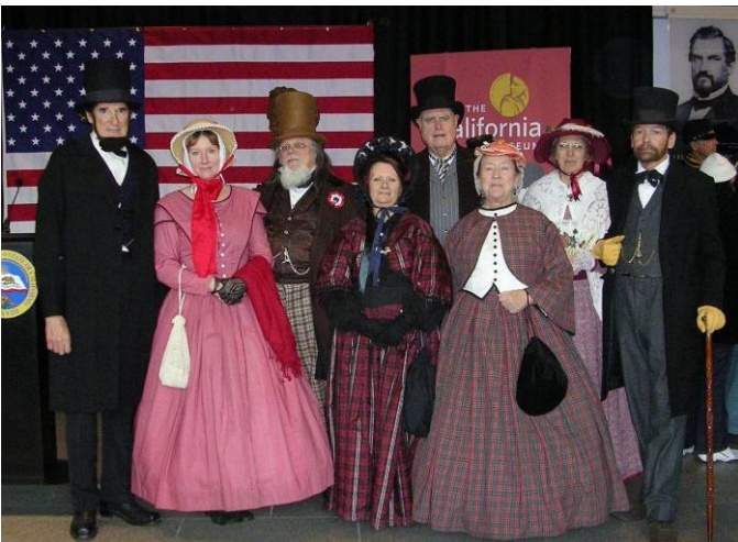
OSLHP members with President Lincoln.