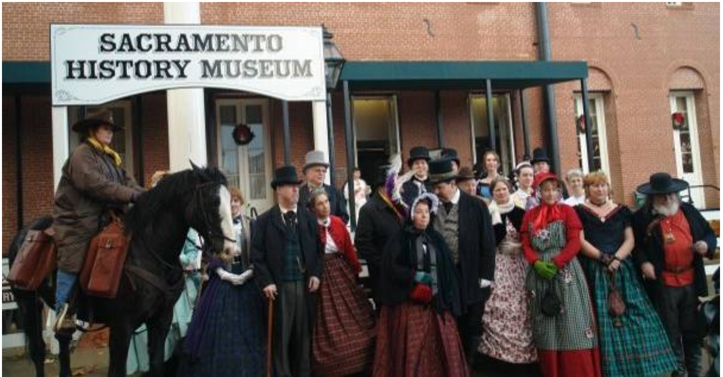
With the Pony Express!