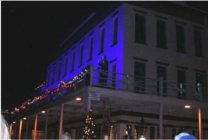
Can you see Mark Twain up there on the balcony?