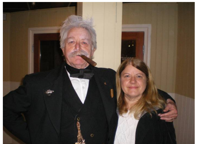
Mark Twain gets fresh with our president.

Looking forward to the New Year, we have a great deal to anticipate. We have use of the Eagle Theatre, which brings us a whole new dimension of activities that we can offer to the public. It also seems that the media and other groups have “discovered” us and are now requesting our presence at events such as the Sacrament Ballet and the Theatre of Lights. Our alliances with other groups are also bringing opportunities to our doorstep that we would never be able to consider before. 2010 promises to be a very good year.