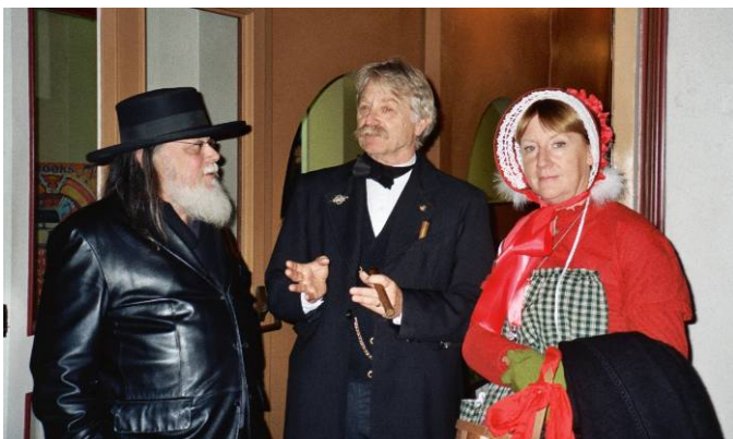
Before the first Theater of Lights performance.