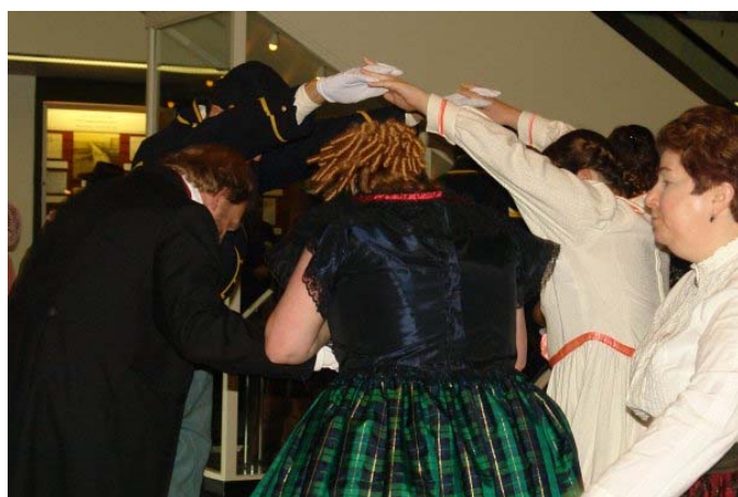
Under the bridge.