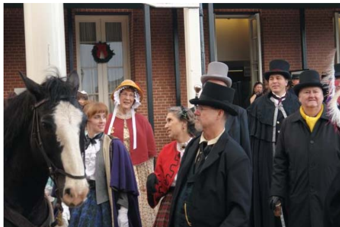
Waiting for mail.