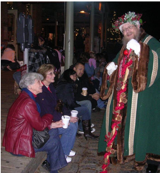
Father Christmas at the Tree Lighting