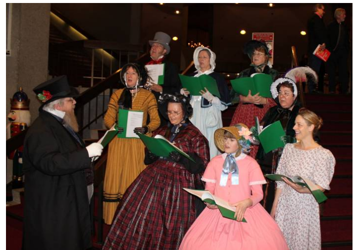
At the Sacramento Ballet's Sweet Sunday.

The Carol Sing-Along on the 19 th was sparsely attended, perhaps because of the close proximity of the holiday. The singers, after a half-hour of melodious Christmas Spirit, adjourned to the streets where we brightened more than a few faces. As always, the diners at Fat's, as well as the public at large, were delighted by our winter finery.