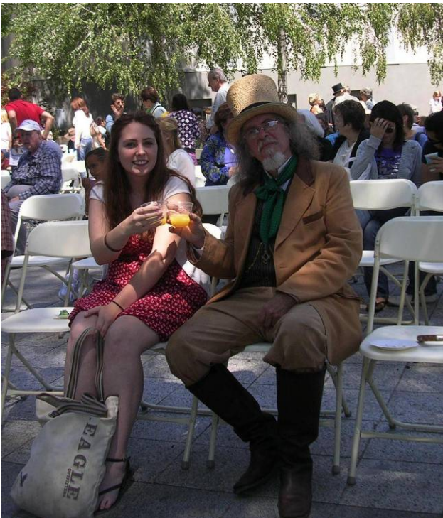
Ashley and Biscuits party like it's 1885.