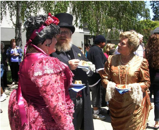
The Crocker family enjoys birthday cake.