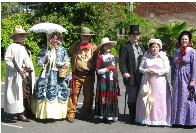
The assembled models