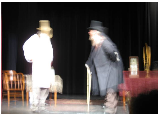
The ghostly Grunnette brothers, or "Why can't those guys stand still??"