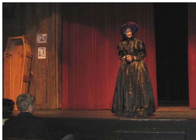
"Don't be afraid... but watch your step!"