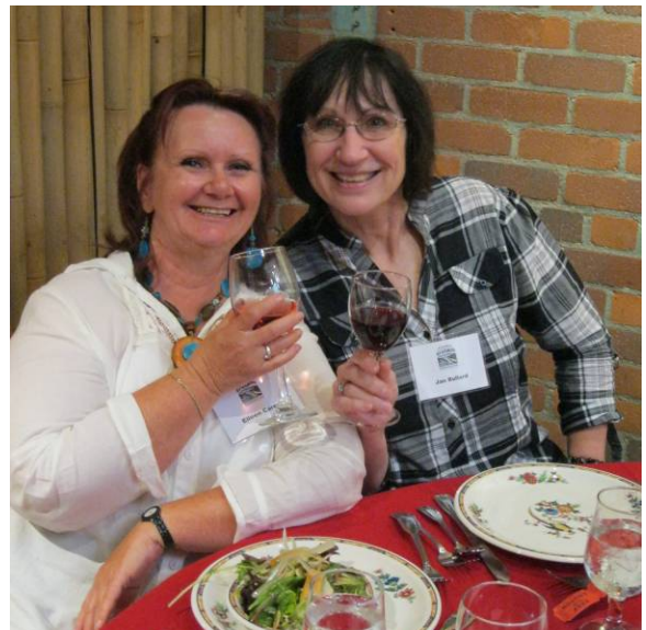
They gave us wine!!