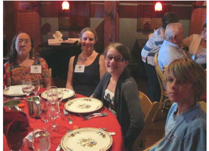
We hope the food comes soon!